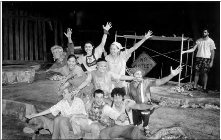
The newly renovated Tempest Theatre is home to two major student theatrical productions each year and an active classroom for the new major in theatre. Pictured here is a scene from the spring 2003 production of “Godspell.”

videos, script analysis and play attendance. This course also fulfills the 100 level Cultural Heritage Theatre requirement of the 1990 Core program. A Writing and Research Intensive Course. Profs. Severeid, Taylor,